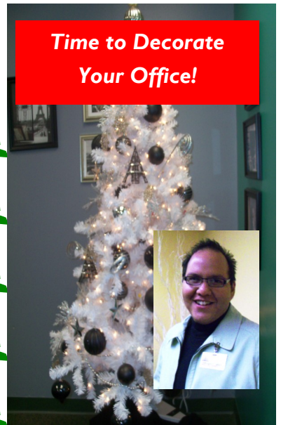
Time to Decorate Your Office!

Friday, December 9, 2011 • 12:30PM Hosted by Project BRAVO (915) 562-4100 Main Office 2000 Texas Ave El Paso, TX 79901