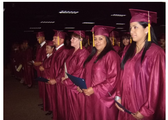
Forty students from Project BRAVO's Adult Education Program proudly accepted their diplomas.